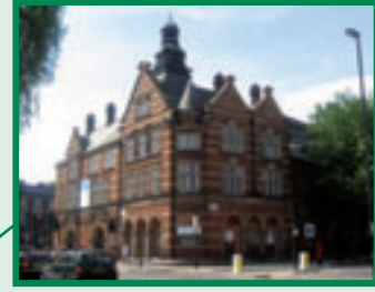
Kentish Town Sports Centre

Start Bidborough Street, behind Camden Town Hall.