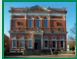
The old Town Hall

This is the last part of the ride once the boundary ride has been completed.